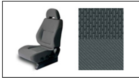
Cloth upholstery (Grey)