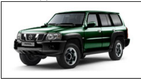
Amazon Green (P)